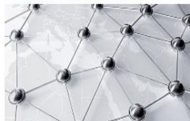
Repair and Maintenance